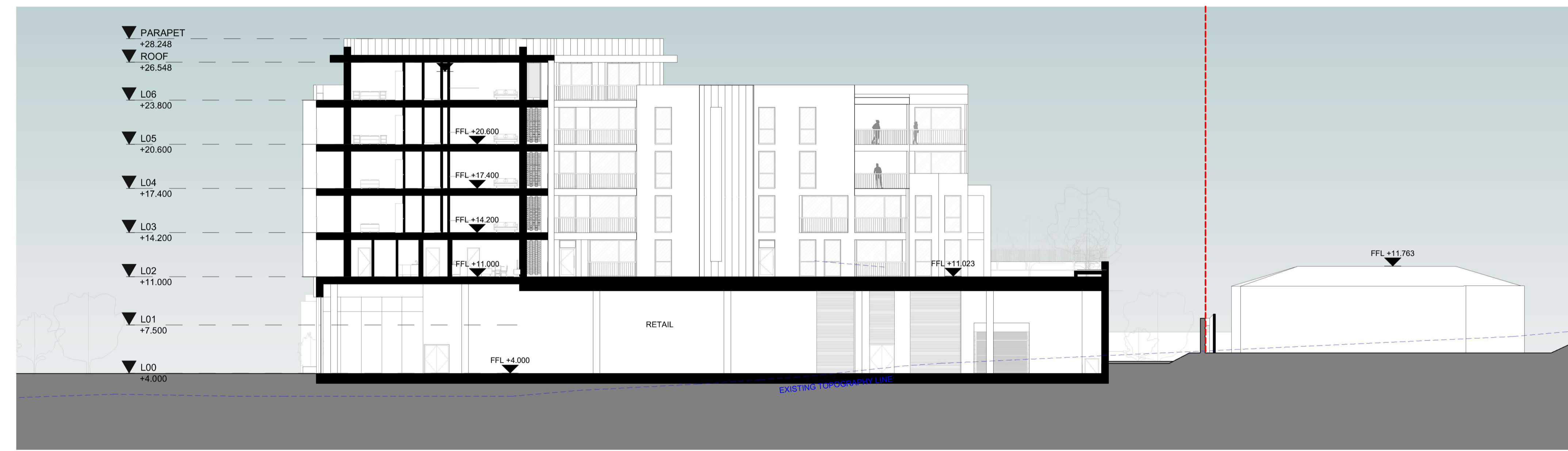
2 SECTIONAL ELEVATION B'B 1 : 200